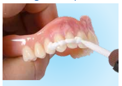
Bredent X-Resin Flow is applied to the full denture using a standard cartridge gun.