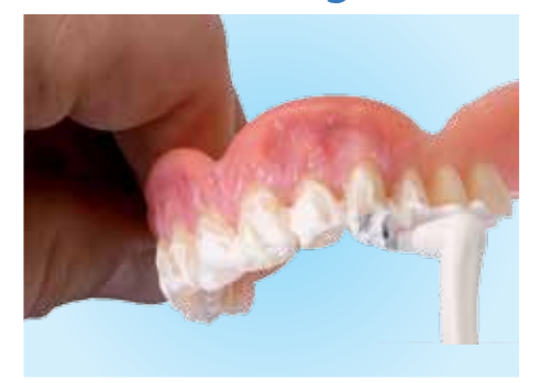
Using a disposable brush, spread a layer of X-ResinFlow starting from the buccal.