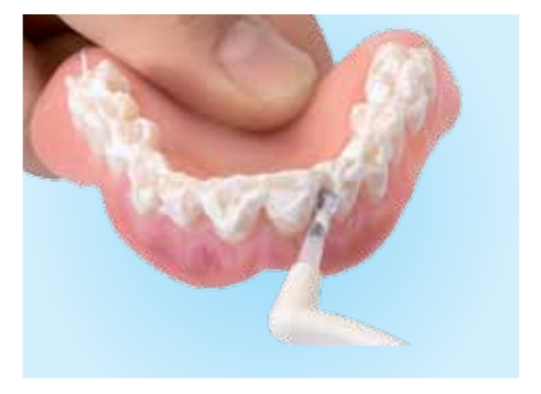
Continue brushing onto both the lingual and buccal surfaces of the teeth.

Bredent's X-Resin Flow radiopaque silicone varnish is perfect for use in implant planning. X-Resin Flow helps fabricate scan templates utilizing the existing denture, and is recognizable in scanned DVT/CT images.