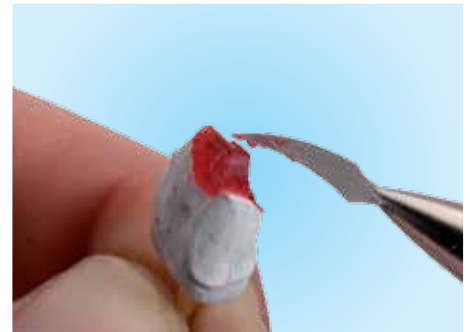
Litebloc UV (52000980) allows fast build-ups and solid curing and can be trimmed by carbides.