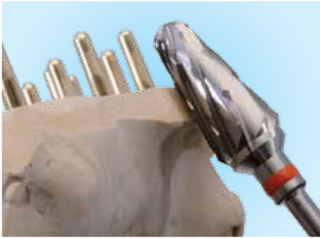
Bredent carbide (H194SH70) provides a smooth surface for the pinned arch which creates a clean model base.