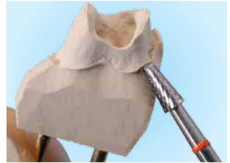
This Bredent carbide (H263GH30) is ideal for the simultaneous removal of stone while exposing the margin.

Bredent provides high level products to help improve accuracy and working time while preparing model and die preparation - especially essential in the case of high precision attachments and implant work!