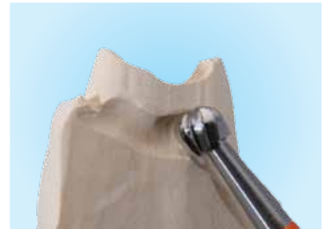
The round carbide (H001NH31) is perfectly suited for exposing the margin border without chipping.

There are a number of different types of margins that can be used for crown preparation. There is the chamfer which is popular with full gold restorations, which removes the least amount of tooth structure. There is also the shoulder which allows for thickness of material such as in the case of porcelain fused to metal or when restoring with all ceramic