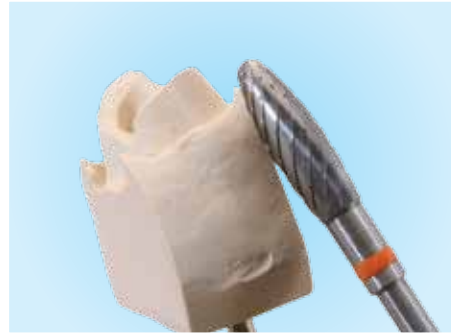
The extra coarse cutting design of Bredent's carbide (H274SH40) ensures fast removal, while producing a smooth surface.