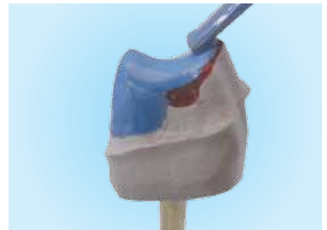
Bredent diespacers produce 8µm to 10 µm. Multiple layers provide the required thickness.