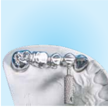
The universal screw driver facilitates removal and insertion.