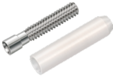
The Friction Splint FS1 Pin & Sleeve