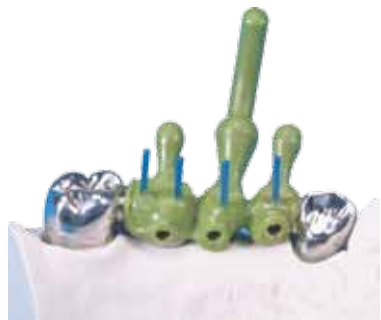
The subframe and secondary wax-ups are ready for the ceramic spacers.