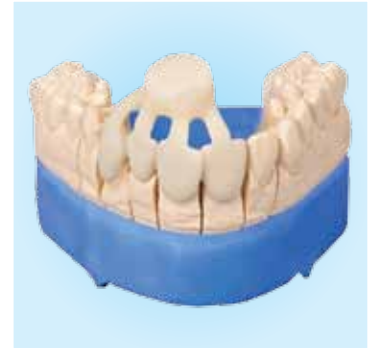
The pressed framework is ready for cutting of the porcelain sprues.

or even slightly crooked front teeth. Usually veneers or laminates can provide these individuals with a completely new looking smile with just a few adjustments. Most often the pre-operative model is prepared and ivory wax is used to achieve the desired aesthetics. This process is time consuming and requires an experienced technologist to be able to create anything meaningful. Fortunately these issues have been addressed in a new product produced by Renfert called GEO Aesthetics Wax Veneers. These veneers can be utilized for diagnostic wax ups, temporaries, pressable ceramics or porcelain veneers. With these anatomically preformed wax patterns one can realise up to 70% savings in time as opposed to waxing up traditionally. In addition to the labour savings, technologists and laboratories can benefit from the consistency of each case produced from this system. The GEO waxes used are of high quality and 100% ash free. An anterior assortment kit includes six upper anterior models and two lower anterior models. These are used as a guide for arrangement and shape of the diagnostic wax up. After a mould has been selected using one of the models,