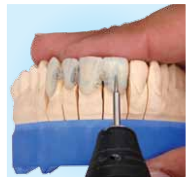
Corrections and character grinding.