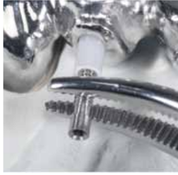
The screw is turned half way into the sleeve and positioned using tweezers.