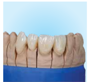
The finished product.