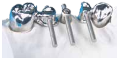
Using the modelling pins