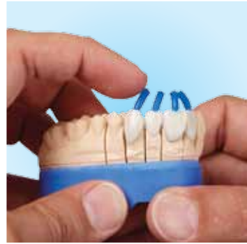
A 3.0 mm sprue no more than 8 mm. long is used.