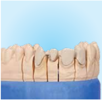
The framework is opaqued in the usual manner.