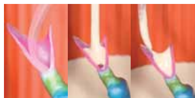
Bredent's NEW Transfuser Investment Tool

Another problem that can be solved by cross-pinning with the friction splint FS1 is the occlusal access holes that are in the aesthetic zone. These openings are unattractive and spoil the occlusal surface and produce weak points in the porcelain to metal interface. To avoid using these occlusal access points the friction splint screw and tube can be utilized to connect the implant prosthesis to the implant abutments, implants or bars. Cross-pinning with a screw system diagonally into the restoration and implant, allows prosthetic recovery without detriment to the implant or abutment alignment. The friction splint is intended for this type of function where recovery without the use of occlusal access points is favoured. The friction fit system has superior stability because of the bilateral support created in the implant abutment and implant supported bar. Another advantage to the FS1 is the rescue of crowns with defective screw connections, by retooling the damaged lingual screw hole to accommodate the FS1 the case can be saved from being remade. During recalls the plastic tube can be easily removed and replaced as seen fit by the clinician. There are many predicaments involving cemented implant restorations, that is why recovery is foremost when commencing a treatment plan. The FS1 is indicated for diagonal cross-pinning restorations to implants and bars when repairs,