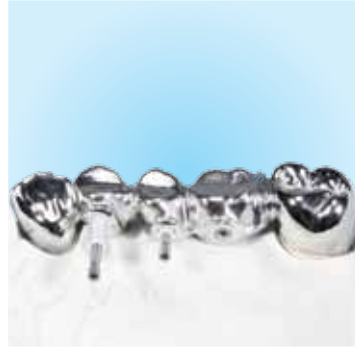
The FS1 screw and tube are placed to hold the primary unit to the substructure.