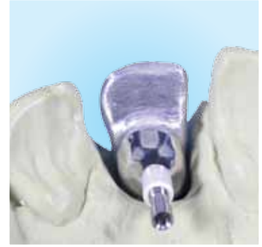
The damaged threads can be retooled for FS1.