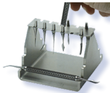
Bredent's NEW Quick Change System.