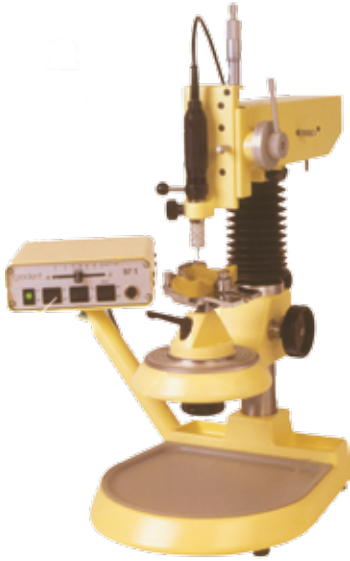
Bredent's BF-1 Milling Machine

and generate very low heat. The best results are achieved at speeds of approximately 5000 RPM's while applying gentle pressure. They are available in packages of 12 and are coarse or medium in abrasive qualities. Call for more information on our featured products at 1-800-250-5111.