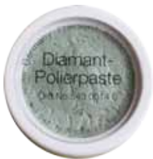
Bredent's Diamond Polishing Paste.