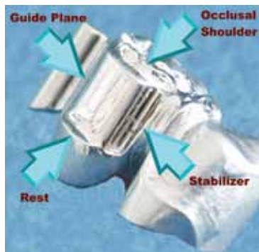
Components of the reciprocal bracing arm.