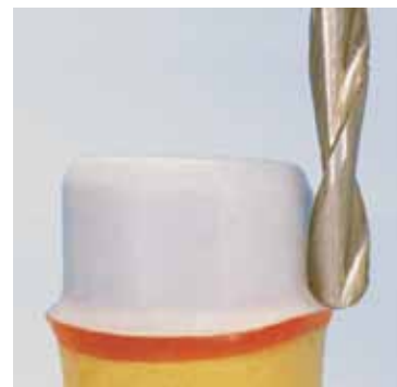
Spiral wax miller 0° with rounded end. F1352W23 at 3,000 to 5,000 rpm.