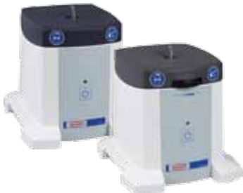
Renfert's new Model Arch Trimmers; Milo (Left) and Milo Pro (Right).