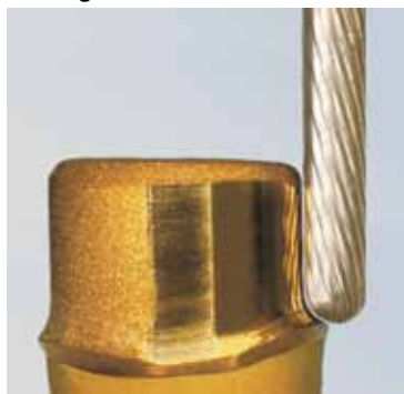
Profile milling bur for prefinishing. F1372H23 at 15,000 to 20,000 rpm.