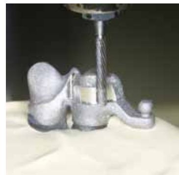
Refine the areas in metal using a 0° flat end profile bur F1162H15.