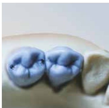
Prepare the out-line of the reciprocal bracing arm with felt pen.