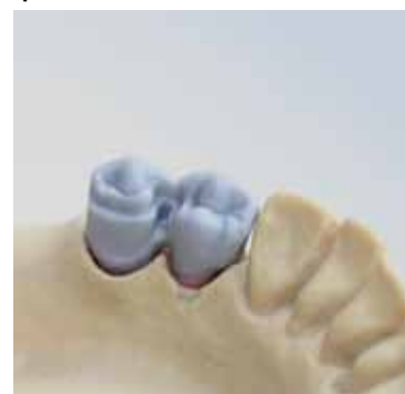
Finalize the wax up with the stabilizer slot and the bracing arm.

the BF1 milling machine will allow different depths in order to obtain optimal accuracy. Interlock grooves which are open to the gingival side offer hygienic advantages as opposed to ones that are closed. There should also be adequate space between the papilla and the crowns so that the interdental space can be cleaned with a fine brush. Drilling in wax and refining the interlock in the metal stage is the most prudent approach. Sprue away from the milled surfaces and make sure the interlocks are completely filled with investment during the investment procedure. After casting in the alloy of your choice, the abutment crowns should be blasted with 50µm AlOx and fitted to dies on the master model. The abutment crowns are fixed to the transfer device with modelling resin (Bredent PiKuPlast 36). The inside of the crowns are coated with a thin layer of vaseline, modelling resin is then filled to the margin and a dowel pin is placed into it and allowed to set. The transfer device is secured into the milling machine chuck and then lowered into a mould filled with wet plaster to create a milling model. The BF1 milling machine provides "free hand" milling with a mobile milling spindle. This machine is designed to be simple and precise for milling, surveying and drilling. The