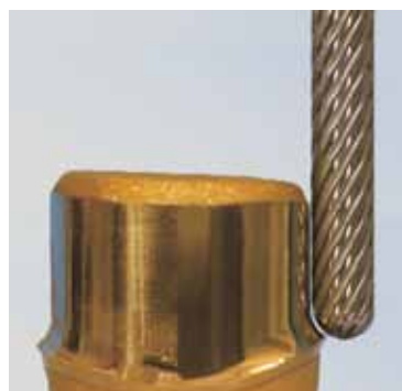
Polish milling bur for final polishing. F1372P23 at 20,000 rpm.