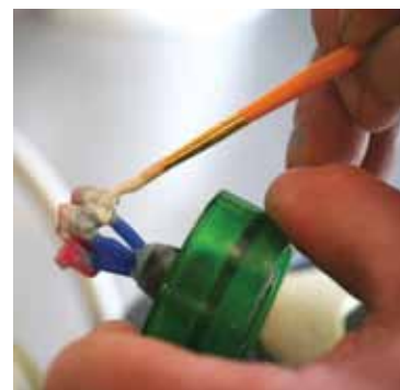
Invest carefully to avoid trapping bubbles.