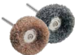
Renfert's Scotch Brite™ are impregnated with an abrasive agent.