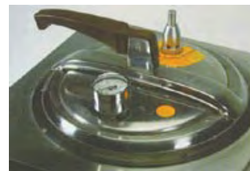
The Opti-Cast resin is polymerized in the pressure pot for 30 minutes at 40 to 50°C at a psi of 30 lbs.