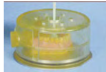
Pour the Bre-Gel into the flask until the vents are slightly over filled.