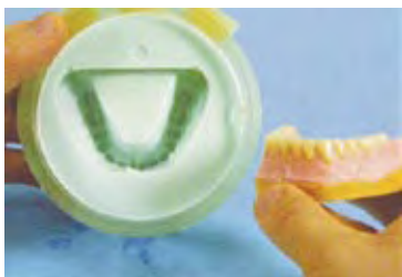
The denture out-line is faithfully reproduced in precise detail.