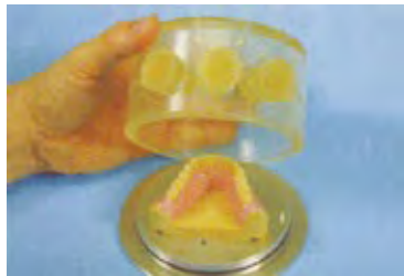
The flask is positioned over the model for the most favourable sprue location.