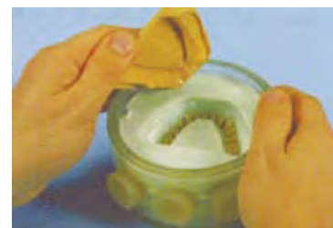
The model is placed back in the gel mould.