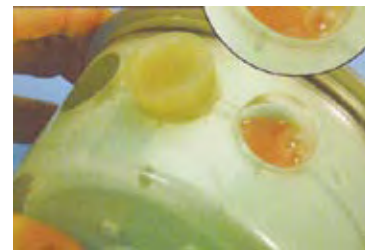
The Opti-Cast pouring resin is poured slowly and carefully into the sprue canal.