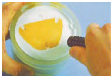
The model is carefully deflasked using compressed air.