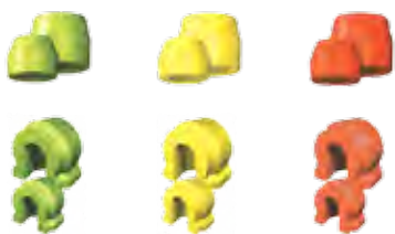
Bredent's Super Snaps provide additional retention levels.