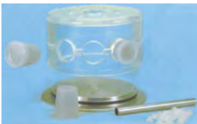
Bredent's Flask System