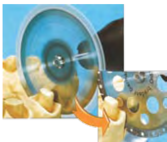
Giflex is available in diameters of 25mm, 30mm, 37mm and 45mm.

to the same extent as conventional injection or packing. During heat curing dimensional changes occur which can affect the position of the pin to the incisal table of the articulator, causing an open bite that will require occlusal adjustments. Because the pour technique does not distort the denture to the same extent of conventional methods, the occlusal space does not change.