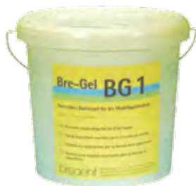
Bredent's Bre-Gel BG1