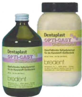
Bredent's Opti-Cast Pourable Resin