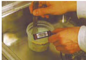
Cool the Bre-Gel in a cold water bath to the dispensing temperature of 40° to 45° C.