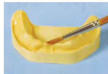
Thinly apply the denture separator, Isoplast, Part. No. 54001019.