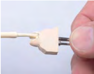
Aqua-Fit Die Spacer is ideal for inlays, onlays and partial crowns.