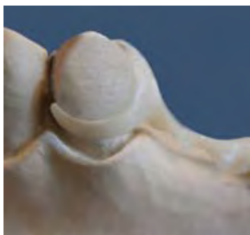
When the clasp is transparent, apply the clasp pushing it in place when soft.