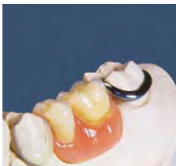
Process the partial with cold cure acrylic to finish the restoration.