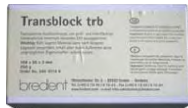
Transblock trb serves as a heat absorber that can be used to press the clasp into position on the model.