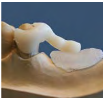
A thermoplastic clasp blank with the selected shade is tried on.