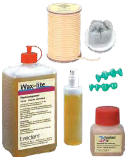
Bredent's Biotec Organic Wax System is ideal for pressible ceramics.

of the waxed restorations. Another component of the system is Biotec Wax Profile Sprues which are also organic with high flexibility and excellent burnout characteristics. The sprues exhibit minimal deformity while remaining completely compatible with Biotec Modeling Wax, thus ensuring clean sprue channels for the best casting results for pressible ceramics. The final compliment to the system is Wax-lite an alcohol free wax wetting agent that exhibits excellent flow behaviour, allowing the investment to reach the finest recesses of the waxed pattern, thus achieving smooth homogeneous surfaces and clean occlusal anatomy. Contact us at Dent-Line for further information at 1-800-250-5111.