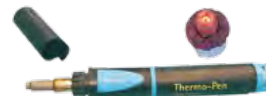
Use Bredent's Thermo-Pen as a flameless heat source to shape the thermoplastic clasps (shown above).