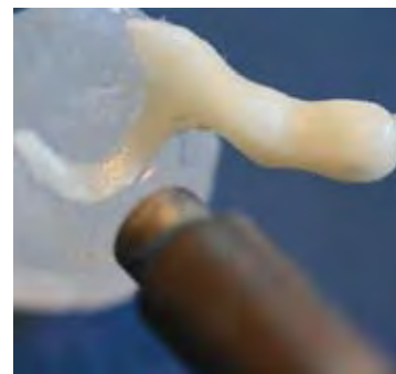
The thermoplastic clasp is placed on the transblock and the thermo-pen heats it up.