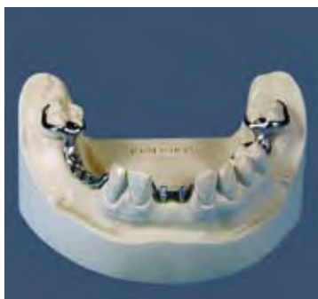
Lower Anteriors prior to incorporating the thermoplastic clasps.