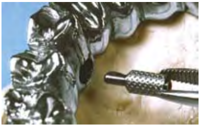
Bredent's Titanium Bond-on Security Lock system is best suited for small jaws or large span bridges.