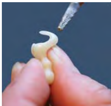
The clasp is shaped to fit the abutment with a carbide bur.