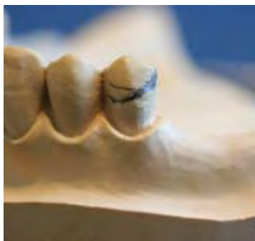
The receiving abutment tooth is surveyed and the shape and position of the clasp are marked.